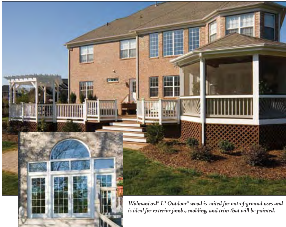
Wolmanized® L 3 Outdoor® wood is suited for out-of-ground uses and is ideal for exterior jambs, molding, and trim that will be painted.

Impact on environment. The biocides in the preservative are known to undergo bacterial degradation in soil, and they are not bioaccumulative.